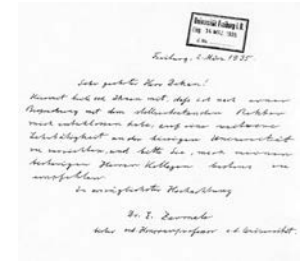
Universitätsarchiv Freiburg, B 24/4259